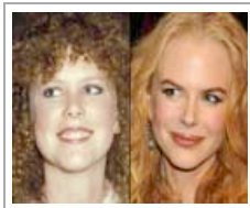
Then and Now A blast from the past - a