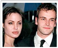
Child Brides Can Jamie Lynn Spears and